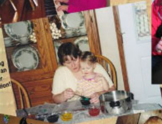
Coloring Eggs- an Easter tradition!