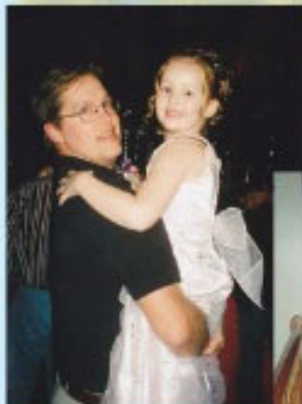
Daddy, daughter dance