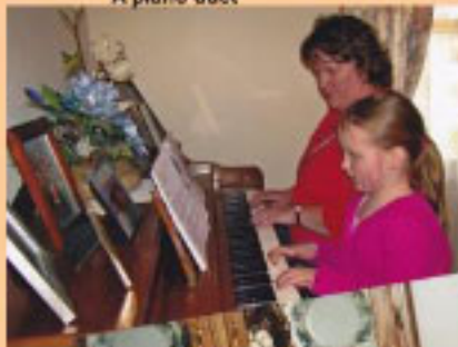
A piano duet