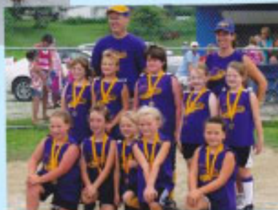
Coaching girls Lball