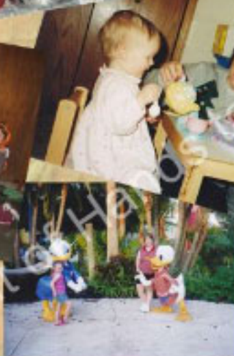
In Florida, posing with the ducks!