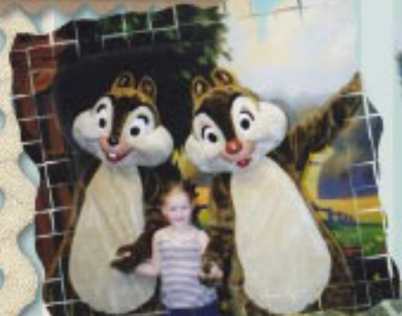
Posing with Chip and Dale at Walt Disney World