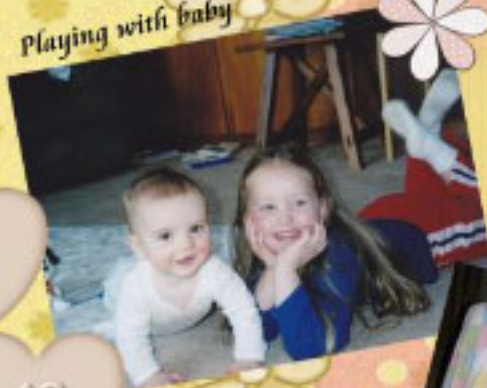
Playing with baby