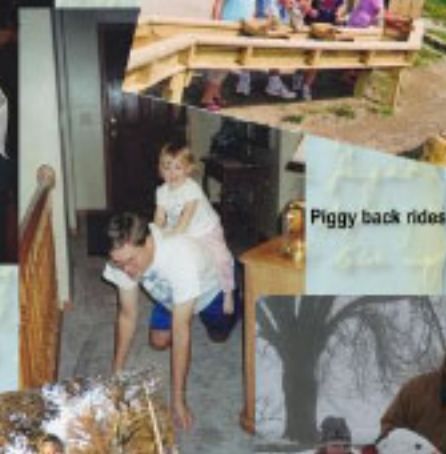
Piggy back rides