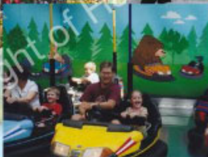
Bumper car fun!