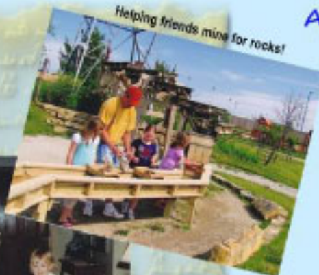
Helping friends mine for rocks!