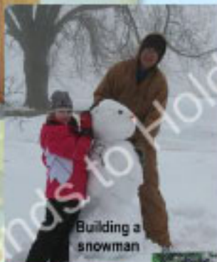
Building a snowman