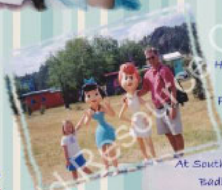
Hanging out with the Flintstones