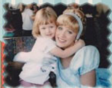
Breakfast with Cinderella at the Castle

We can't wait to share Family Vacations with a new family member!